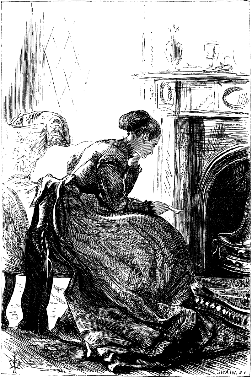
“So she burned the morsel of paper.”